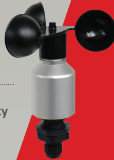
▶ Wind Velocity sensor